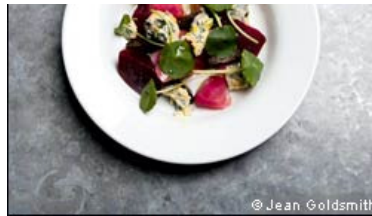
Ratnesh Bagdai's beetroot with blue cheese, pickled walnuts and pennywort

restaurants have to be run, two other experiences taught him the most about how to look after customers.